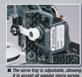
it to accept all popular micro servos.