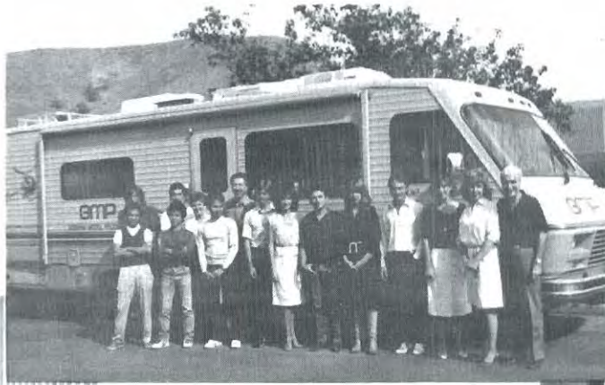
CALABASAS, CALIF AND GREENVILLE, PENN