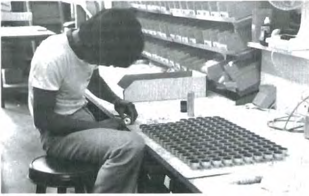
ALL OUR CLUTCH BELLS ARE TESTED AFTER ASSEMBLY BEFORE GOING INTO KITS