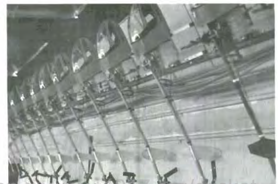
BUILT CRICKETS - READY FOR DELIVERY!