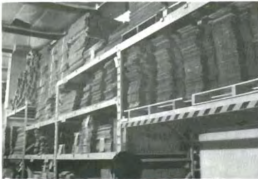
SHIPPING AND PACKING MATERIAL WAREHOUSE