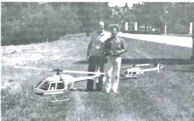
ANY NEW IMPORT KIT ADDITION TO OUR PRODUCT LINE WILL BE INTENSIVELY TESTED TO SEE IF IT MEETS OUR STANDARDS. IF NOT, WE WILL NOT CARRY IT.