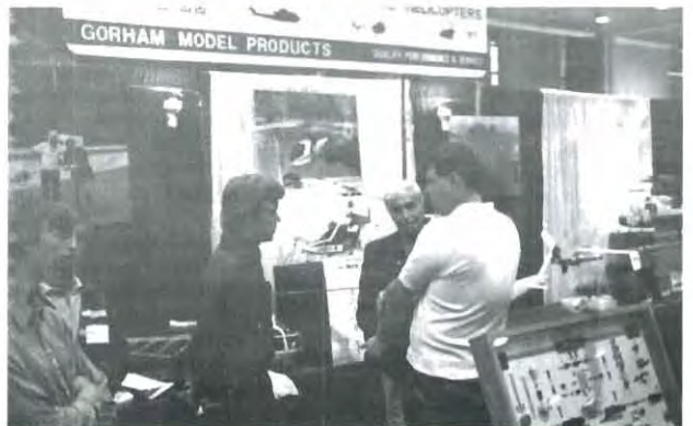
WE HAVE LARGE BOOTHS AT SIX MAJOR TRADE SHOWS - NEW YORK, SEATTLE, CHICAGO, LOS ANGELES, DALLAS. SEE US THERE.