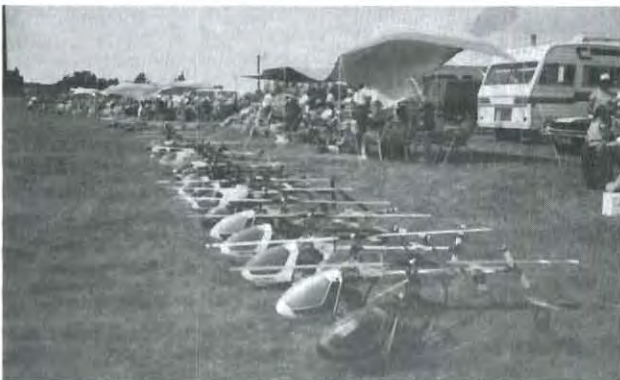
HERE'S A LINE-UP OF GMP MACHINES AT THE U.S. NATIONALS - 60% OF U.S. FLIERS FLY GMP