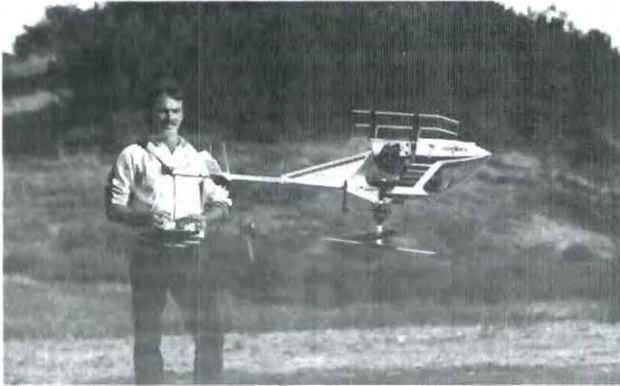
ALL GMP PRODUCTS ARE RIGOROUSLY FLIGHT TESTED AT OUR FLYING FIELD - HERE'S COBRA BEING CHECKED OUT