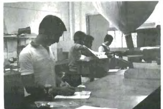
SHIPPING CREW AT MAIN GMP PLANT