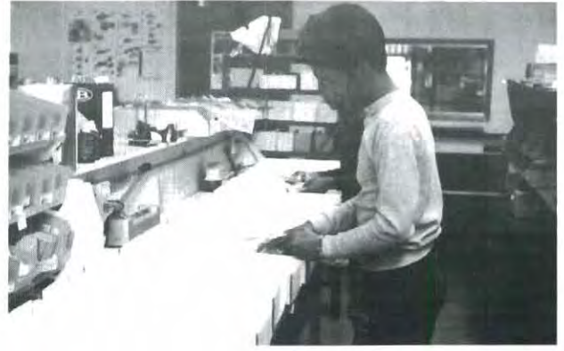
THE CRICKET PRODUCTION LINE - CRICKET IS THE WORLD'S MOST POPULAR .25 POWERED TRAINER/SPORTS HELICOPTER