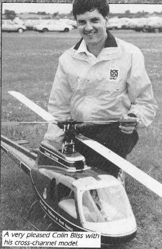
The Bliss Squirrel is a scale model of the chase helicopter.